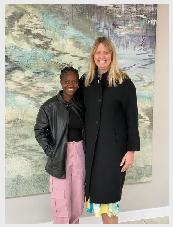
The daughter of H.R.H. participated in the cross-cultural journey and is seen here at Manchester University.