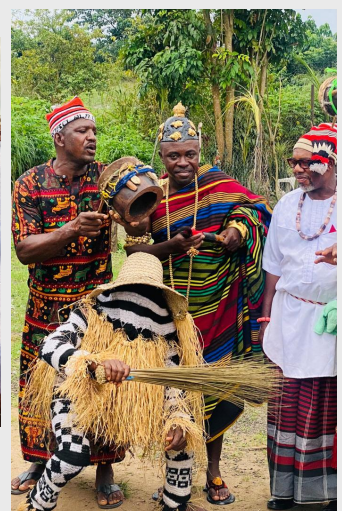
Enjoying a royal dinner with the prestigious Gold Fire Dogs in

Singapore, strengthening international relationships and cultural exchange.